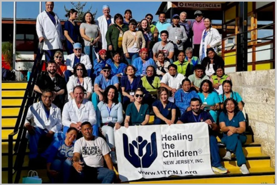
Arequipa, Peru - April 2024