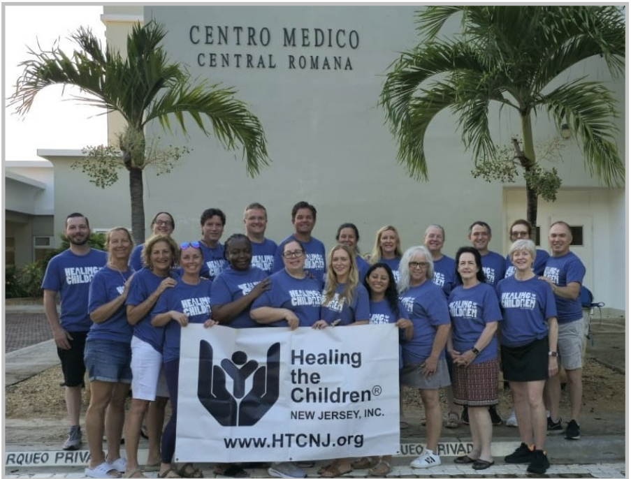
La Romana, Dominican Republic—September 2024